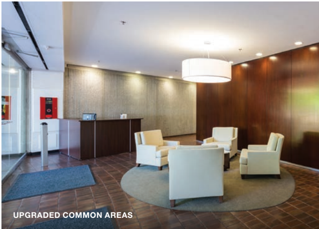
UPGRADED COMMON AREAS

1190 W Druid Hills Dr 2801 Buford Hwy Atlanta, GA 30329