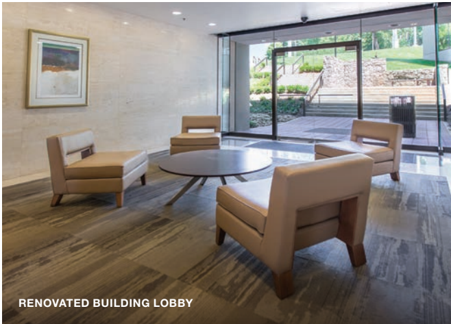
RENOVATED BUILDING LOBBY