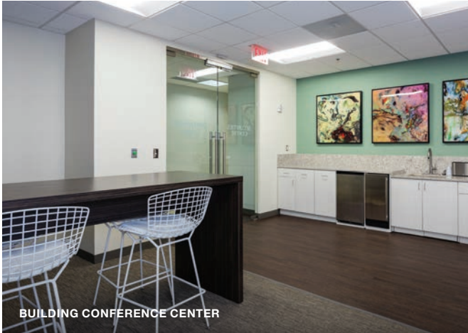
BUILDING CONFERENCE CENTER