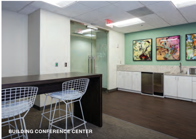
BUILDING CONFERENCE CENTER