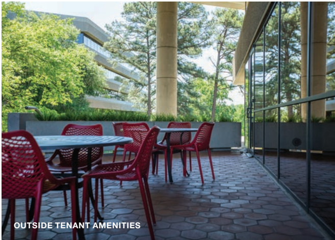
OUTSIDE TENANT AMENITIES

5901-5909 Peachtree Dunwoody Rd Atlanta, GA 30328