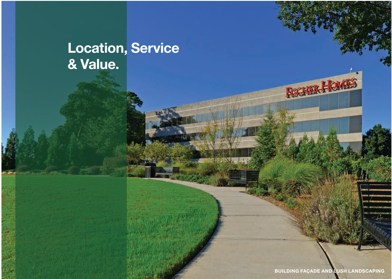
BUILDING FAÇADE AND LUSH LANDSCAPING