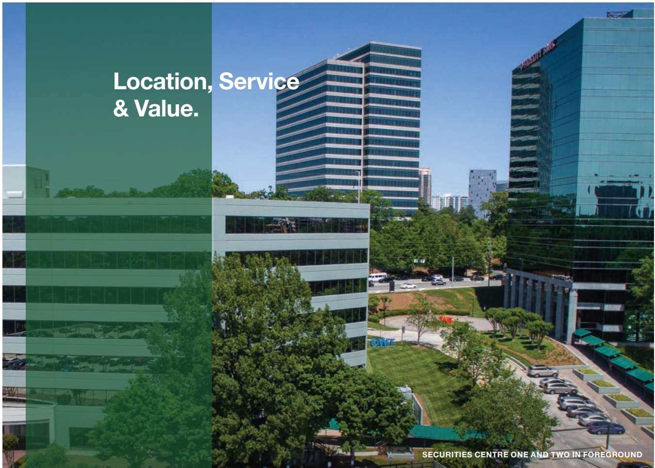
SECURITIES CENTRE ONE AND TWO IN FOREGROUND