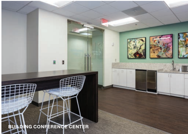
BUILDING CONFERENCE CENTER