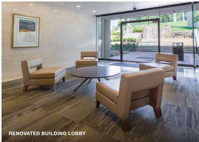
RENOVATED BUILDING LOBBY