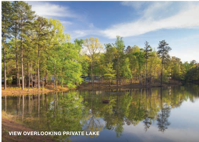
VIEW OVERLOOKING PRIVATE LAKE