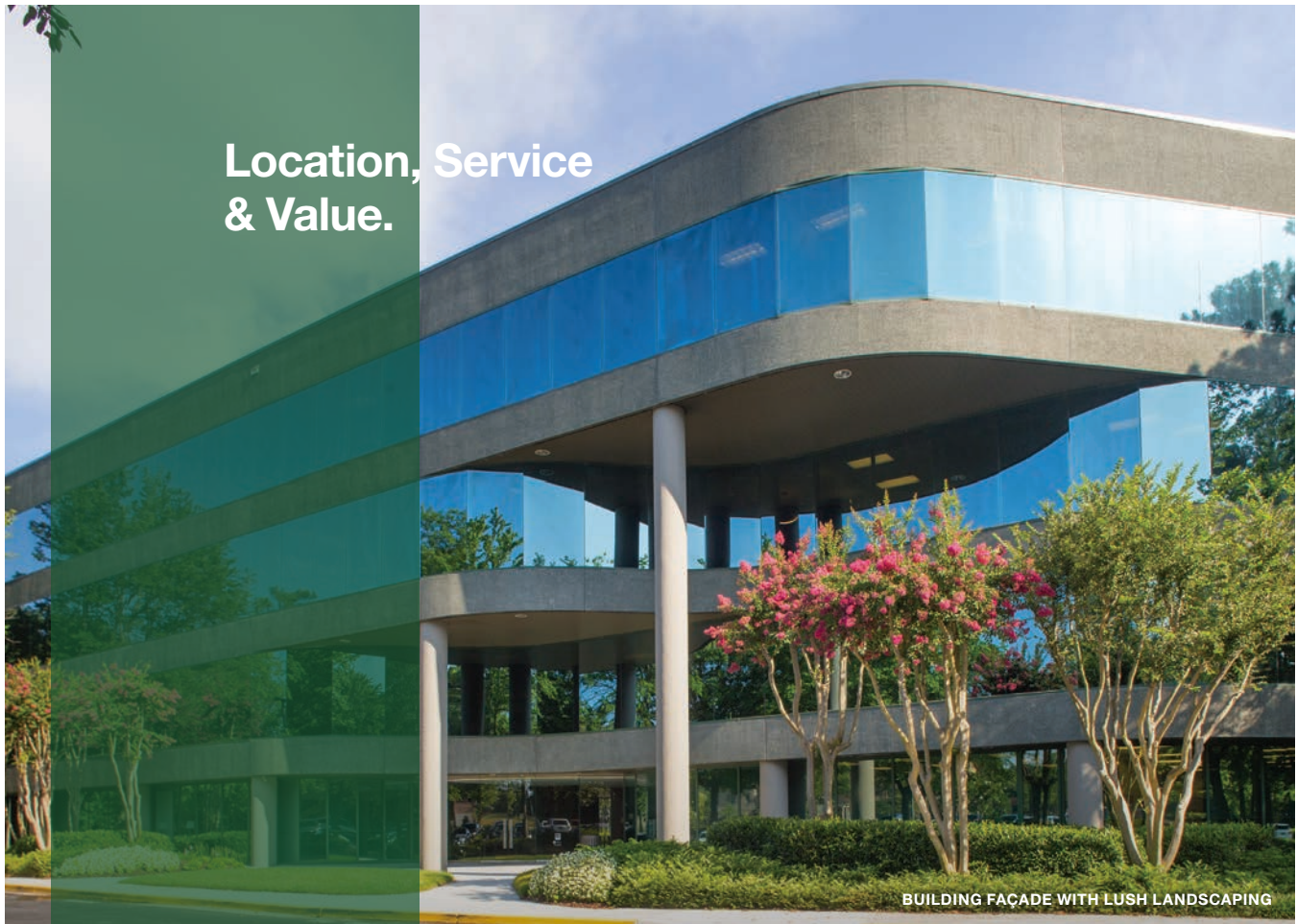
BUILDING FAÇADE WITH LUSH LANDSCAPING